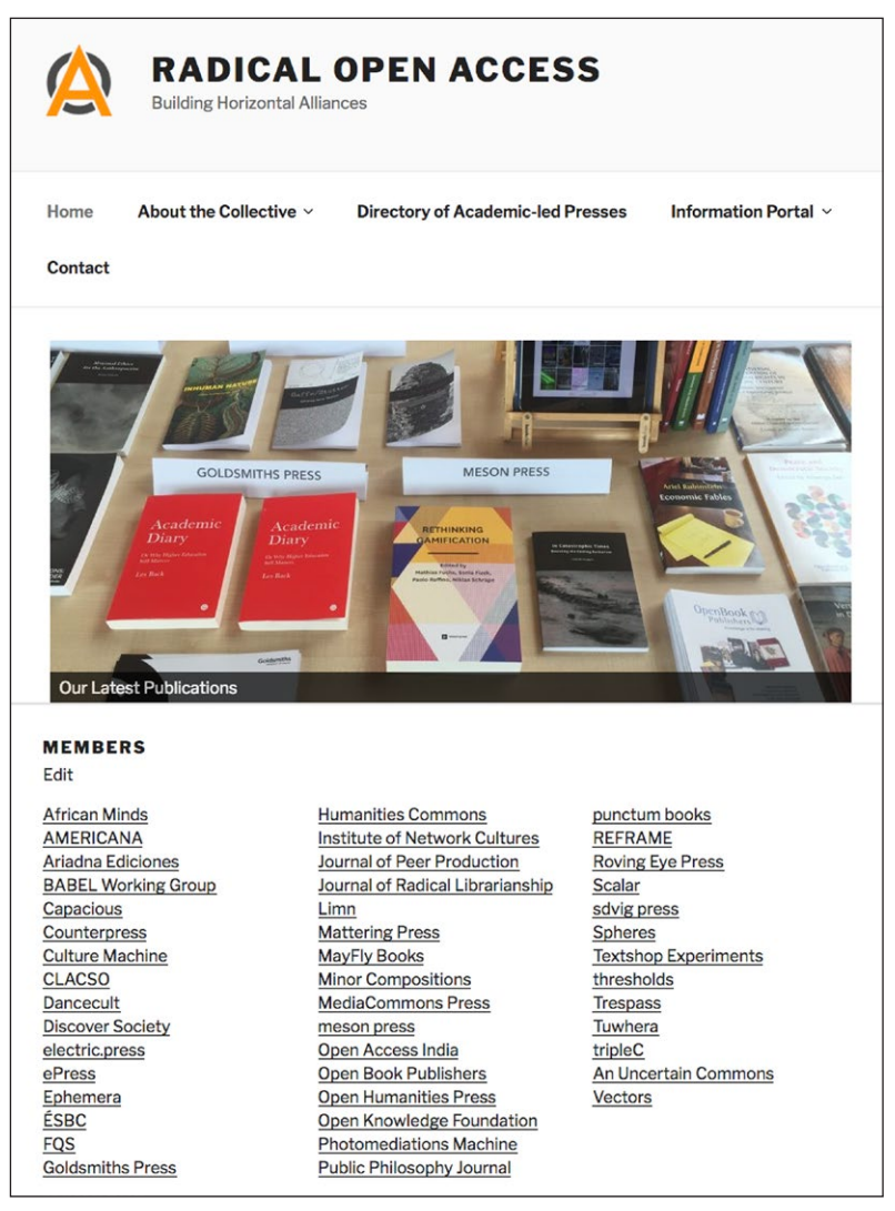
Figure 2. ROAC website: list of members

So, based on the contingent and multipolar philosophy of radical open access<sup>26</sup> and in line with the recommendations of the report to Jisc, the ROAC was set up as a further means of working towards a framework of resilience, of strength in diversity and in numbers (Figure 2). Part of the reasoning behind this is that we feel, in the long term, it will be