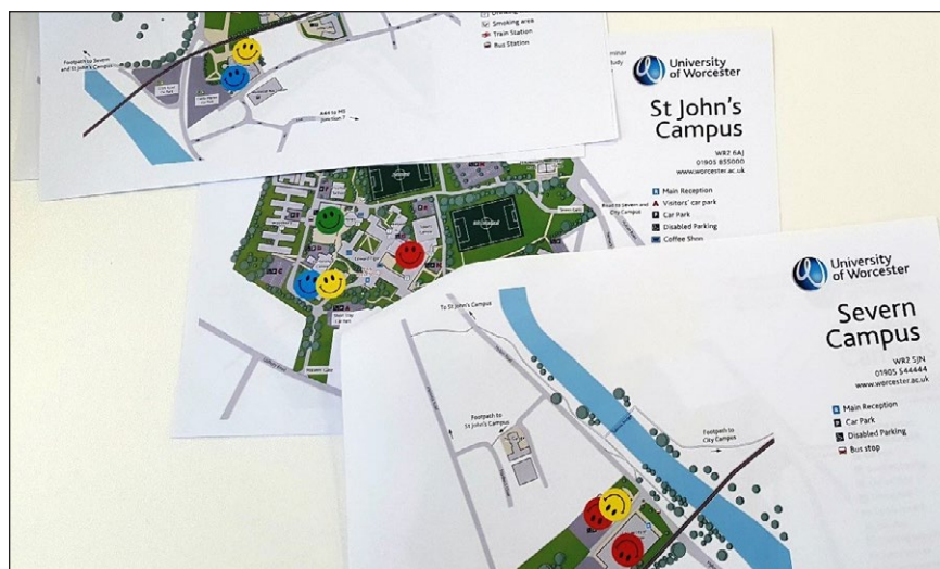
Figure 7. Study mapping

A third project sees us contributing to institutional interest in learning spaces. We have spent time using campus maps and colour-coded smiley stickers so that students can show us where they study alone, in groups, where they attend lectures and where they socialize. We hope to develop this work further into something like the Cambridge Spacefinder app (Figure 7). 8 Our plans involve getting students to further supply information about study spaces, including proximity to coffee, power plugs, etc., and then to utilize a computing project student to make the information accessible.