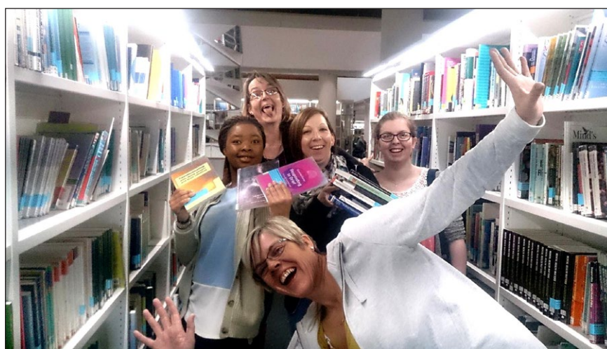
Figure 5. 'Shelfies'

Reffie also took a starring role in induction. At the end of their self-guided tour, students were encouraged to take a 'shelfie' with Reffie, i.e. a selfie when they had found their shelf. (See Figure 5.) Again, this was a student-led initiative designed to engage students with the library in a positive way, taking ownership of spaces and services.