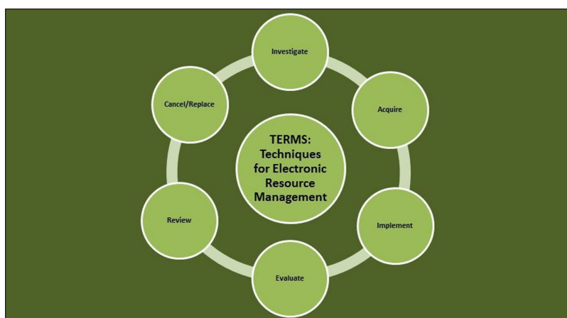
Figure 1. TERMS Version 1 (originally titled 'The six TERMS') 2

Version 2.0 of TERMS was published as an open access book 3 in 2019. It featured revised sections and widened its reach beyond journals and databases to include more content types such as multimedia, e-books and open access. TERMS 2.0 was designed to work on the Pareto Principle 4 where 80 per cent of the work is invested in 20 per cent of the content managed. Each subsection was further divided into three parts, basic, complex and open access, although the three parts may be interrelated or share the same principles of electronic resource management (see Figure 2).