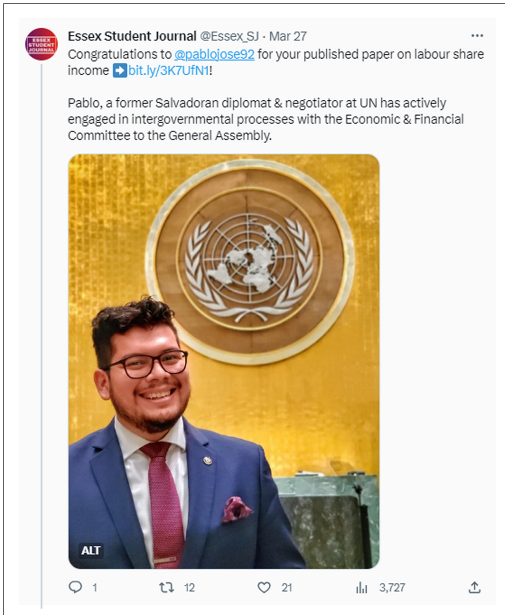
Figure 2. Tweet from (@Essex_SJ, March 27, 2023)

Promotion and outreach are also achieved via news stories within the journal's website.