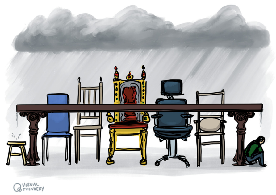
The colonial table

Someone from India, living in Ireland, recently told me that they sometimes forget that Ireland is a post-colonial country. In some ways, this did not surprise me. What gives me – a white well-educated man, living in a country now rich, an ‘invisible weightless knapsack of special provisions’ 15 slung across my back – the right to speak of post-colonialism, of decolonization? Walking around in the skin of the conqueror, his words falling effortlessly from my tongue, I stroll past the gleaming offices of the scions of Silicon Valley. They are the homes of the tech giants who have set up their European headquarters in Dublin. They are new fortresses in our oldest colonial locus, lured by tax breaks and English-speaking labour back to their old lair. The payment that our own Great Emancipators promised us centuries ago: the kingdom ever after, for the simple price of a language. All we needed to be was ‘sufficiently utilitarian not to regret the gradual abandonment of it’. 16 And thus, although ‘the history of the Irish people can be traced like a wounded man through a crowd – by the blood’, 17 we would reach a promised land. We would find an end to the perpetual story, an end to the rain, and a seat at the great colonial table.