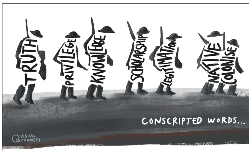
Colonization and scholarship