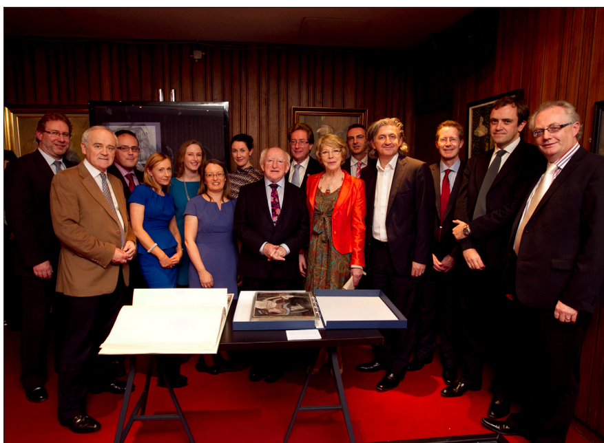
President of Ireland, Michael D Higgins, at the launch of the archive partnership

This collection of production, publicity, administrative and financial records represents a massive research resource and was the centrepiece of the institutional partnership established between the Abbey Theatre and NUI Galway and formally agreed in April 2012. The President of Ireland, Michael D Higgins, launched the partnership between the two institutions in October 2012 (see photograph).