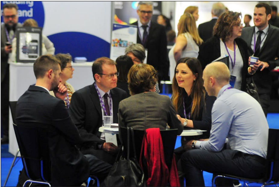
There were freebies, food stations and fun competitions in the exhibition hall – but also plenty of opportunity for networking and getting down to serious discussions