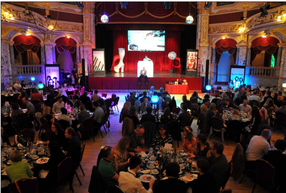
The 'bombastically gilded Royal Hall, complete with a giant glam rock boot on stage', venue for Monday night's entertainment