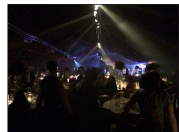
The fabulously decorated marquee with its hundreds of ruby red lights was eventually revealed!