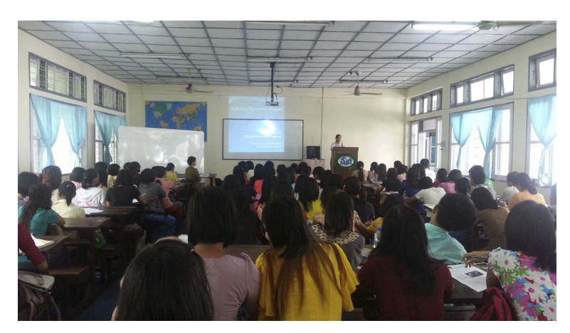
Training session for the International Relations Department, Yangon University, which was attended by over 100 faculty and students