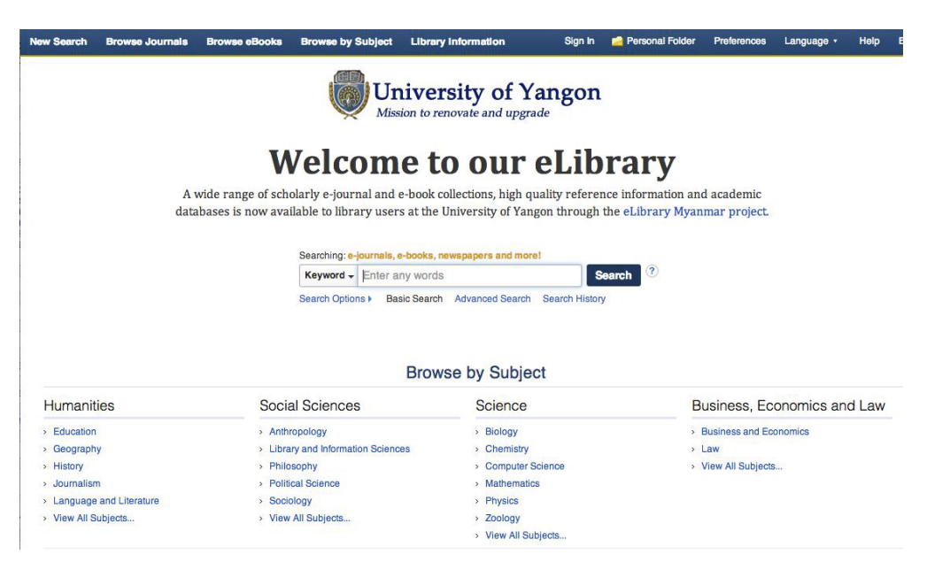
Figure 1. Yangon University's new eLibrary gateway

"...the publishers involved have been wonderfully supportive ..."