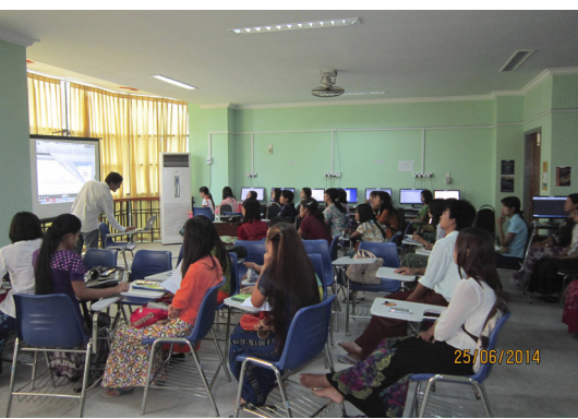
Training in Mandalay University's eLibrary room