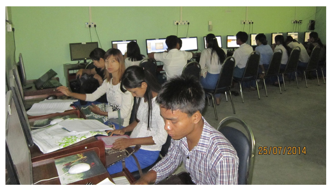
What a difference a few months can make! There is rarely a spare seat in Mandalay University's eLibrary room

Susanna says that the publishers involved have been wonderfully supportive, but licensing this wealth of content was only part of the answer.