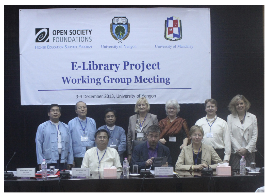
Kick-off meeting for the EIFL eLibrary Myanmar Project at Yangon University, December 2013