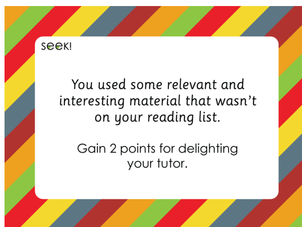
Figure 2. Example of a SEEK! wildcard